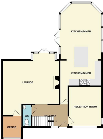
GROUND FLOOR 863 sq.ft. (80.2 sq.m.) approx.